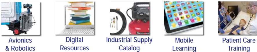
Avionics & Robotics